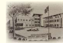
Community Health Facility 1999-present