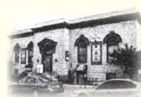
701 New Hampshire St. 1970-1980