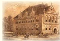
Lawrence City Hall (now Watkins Community Museum) 1929-1970