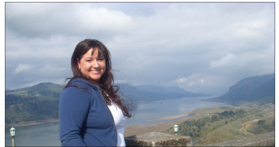
A view overlooking the Columbia River.